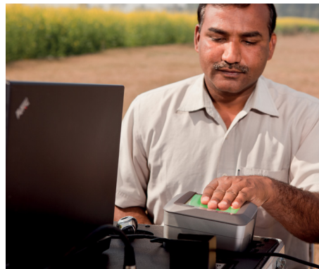
Mass enrollment, India