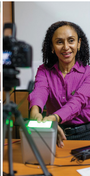
Fingerprint capture for passport delivery, Panama