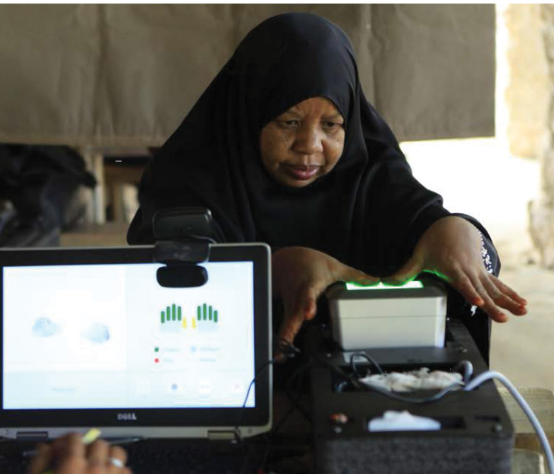
Fingerprint capture during voter registration, Kenya